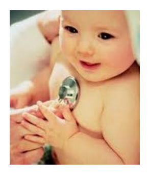
When is the right time to call the doctor??